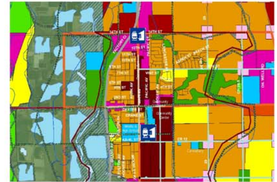
Downtown Fort Lupton